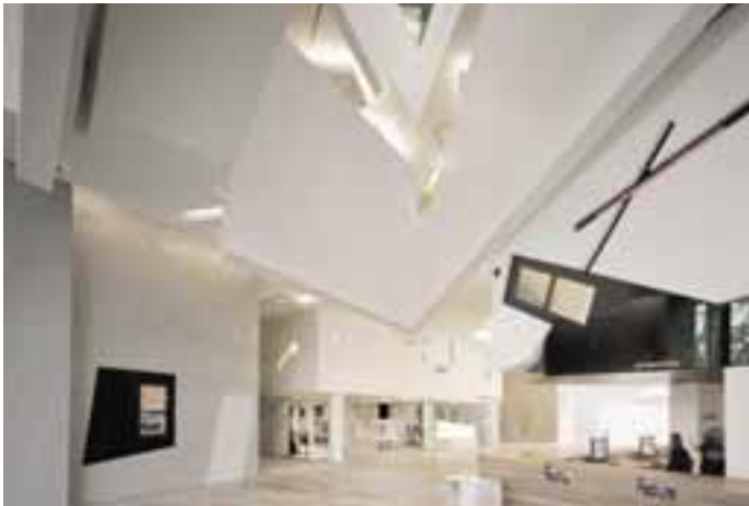
NGVA Foyer, Federation Square, Melbourne