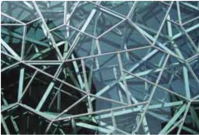
Atrium, Federation Square, Melbourne