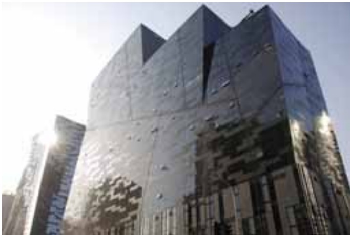
Soho Shang Du, China