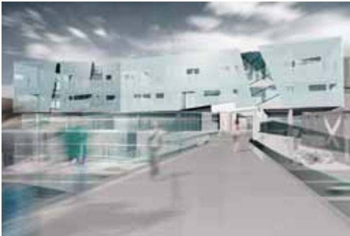
Central Building, University of Sydney